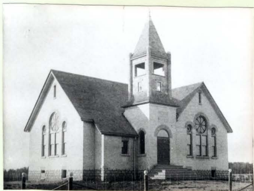
Chalmers Church, Cowal, as it appeared in 1902 when it was first built. Note the wide front steps, fence, and the lack of trees.