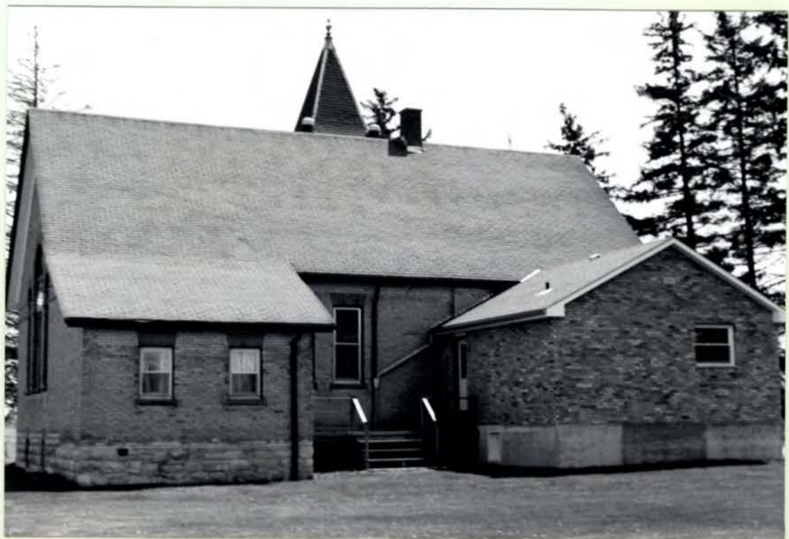
View of Chalmers United Church from the back showing the addition of the new kitchen and washrooms which was made in 1980. The new part is on the right with the vestry on the left side.